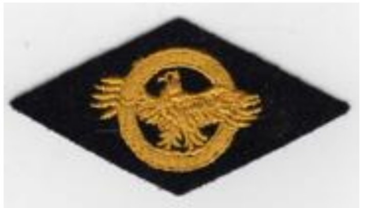
US Navy Discharge "Ruptured Duck" patch